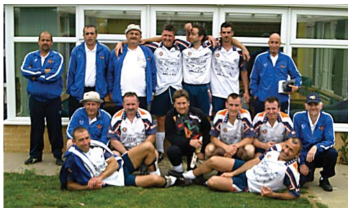
The lads from Millen – next year they have promised to bring their ladies' team, to give us half a chance of winning.