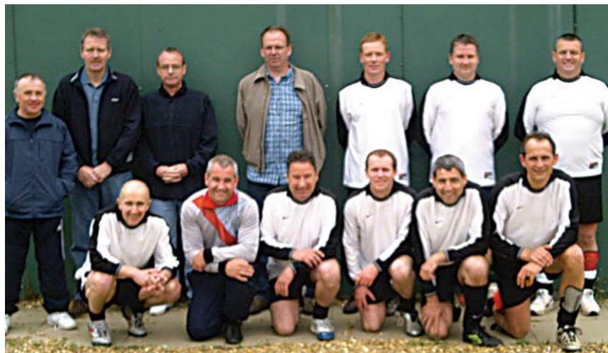
Incredibly, this lot won.