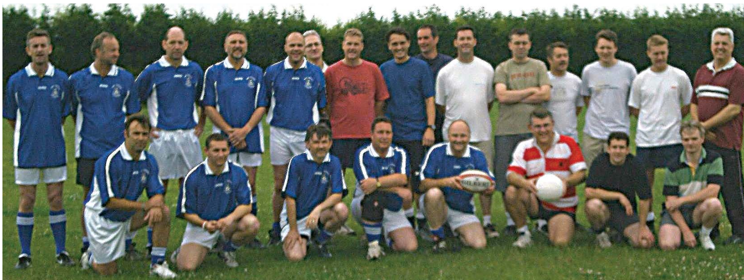
Photo shows Vets and Rugger lot before the rugby game. Note turncoat in the middle (luckily his rugby passing was no better than in football) as well as ringer second from right in the white t-shirt.