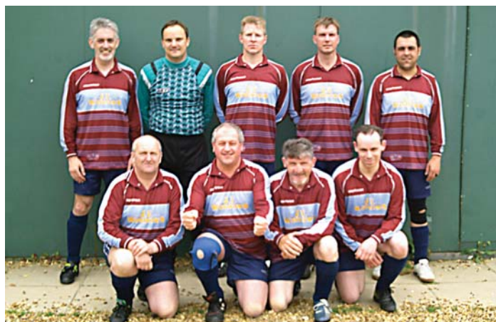
The team from Ridgeons – presumably the bloke second from left in the front was their driver.