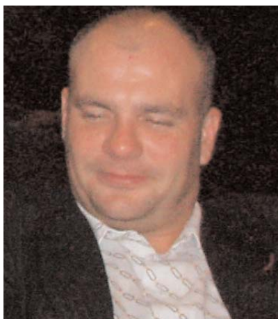
Photo on the left shows new boy Dave Reed in classic Vets pose of two pints in hand. On the right we see 'popular comedian' Al Murray 'Pub Landlord'. But have we ever seen the two together in the same room at the same time? OG's sniffer hounds are on the case.